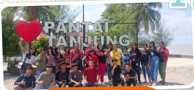
Youth Camp 2024

We hold this Camp activity to be able to approach them more and provide new things for them to motivate them to continue to have a longing to continue to grow and serve God in their youth. In this Camp activity we teach them how important it is for us to experience God personally and build a more intimate relationship with God.