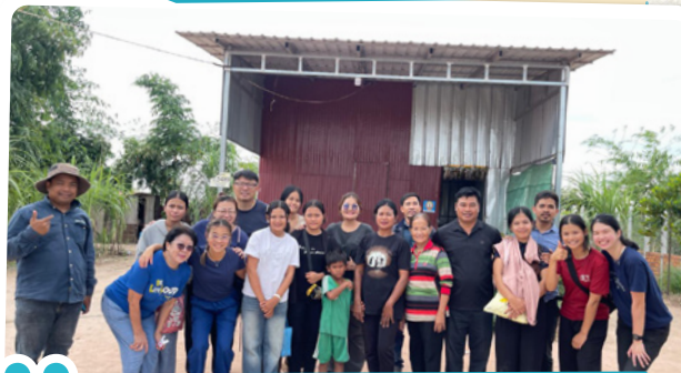
COS and COSR co-workers at CO Run Ta Ek (new settlement area)