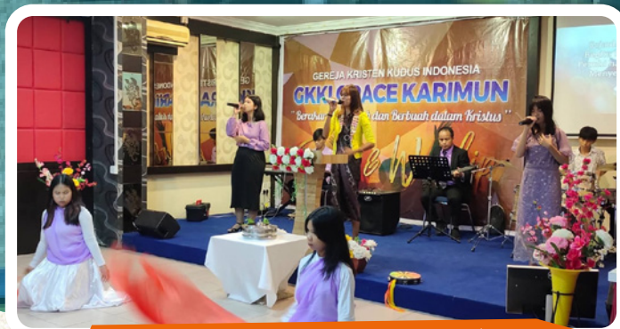
Youths serving in the Sunday Service