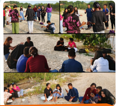
Youth ministry in Teluk Setimbul

Praise God at this time some of the youth have begun to participate in Sunday services, such as worship leaders, singers, tambourine dancers, multimedia and even for ministry in Sunday School and also children's services in Teluk Stimbul. We provide training and also mentoring for them to be able to be involved in each of these activities. The way of training and mentoring that we do is by providing models or examples of ways to teach Sunday school children and providing guidebooks to be studied first. Regarding the worship praise service, we will first observe those who have the desire to be involved in the praise team, and we also do exercises with them.