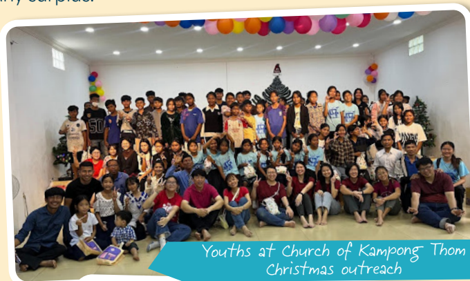
Youths at Church of Kampong Thom Christmas outreach