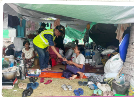
Food distribution to earthquake survivors