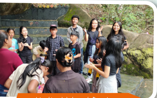
Youth ministry at Pongkar