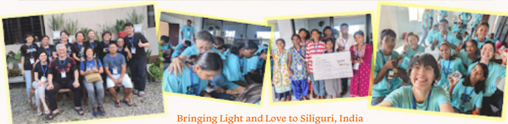
Bringing Light and Love to Siliguri, India

The fruit of Spirit is love, joy, peace, patience, kindness, goodness, faithfulness, gentleness and self-control. Galatians 5:22-23