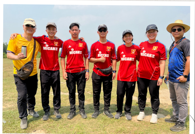
COS & TMTG Family