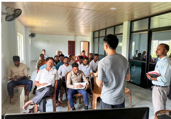
During the discipleship workshop

During the discipleship workshop, we got to know some of the TMTC alumni who are now pastors in some of the villages in Siliguri. It was wonderful to hear them share about their various ministries.