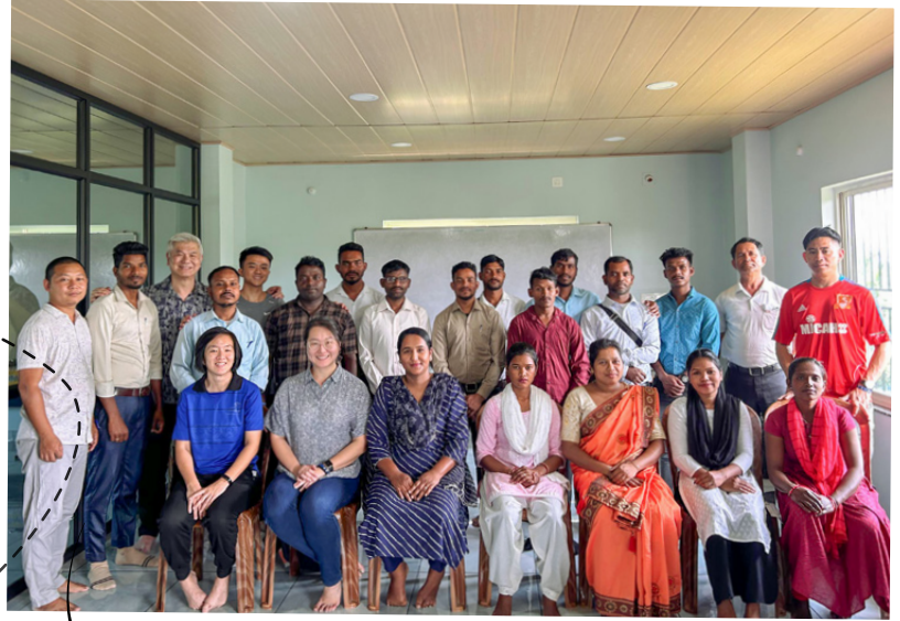
All the past TMTG graduates at the discipleship workshop