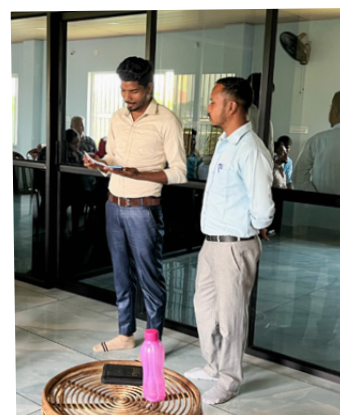
A TMTC graduate sharing